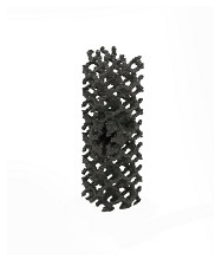
20 mm Ø 8 mm porous cylinder

It can be stabilized to a synthesis medium such as a plate by means of a 1.5 mm screw.